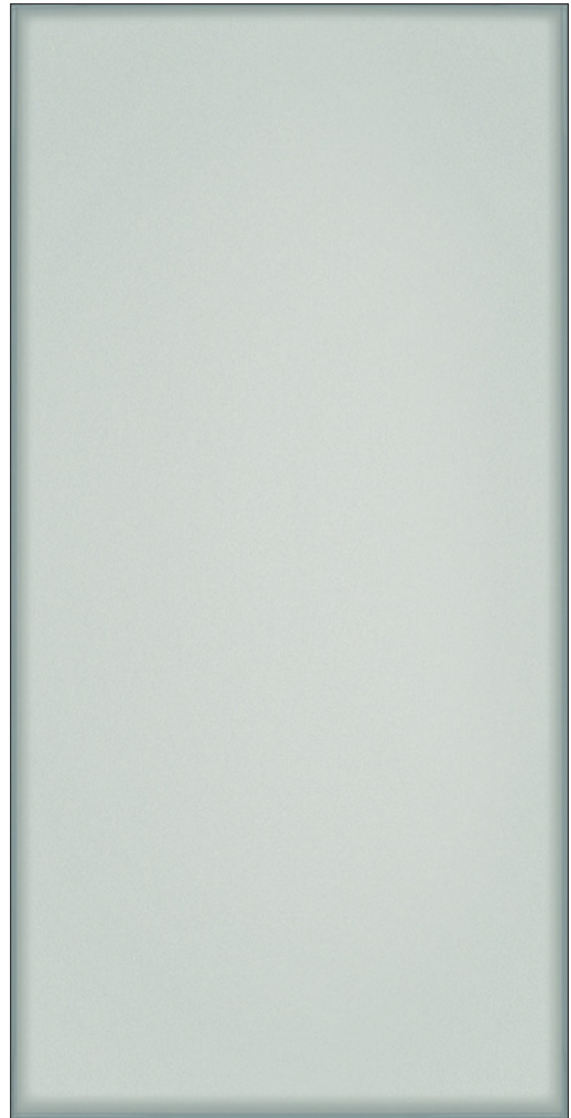
NATURAL (Grey/Blue) Polished

20 x 60 cm (7.87" x 23.622") RF.VT.BIA.0824.PL